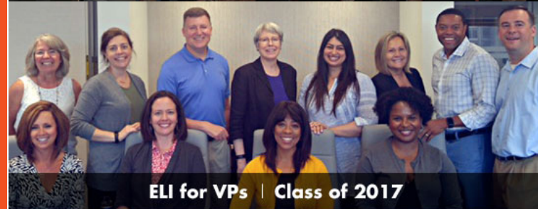
ELI for VPs | Class of 2017