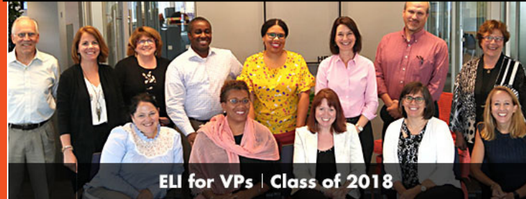
ELI for VPs | Class of 2018