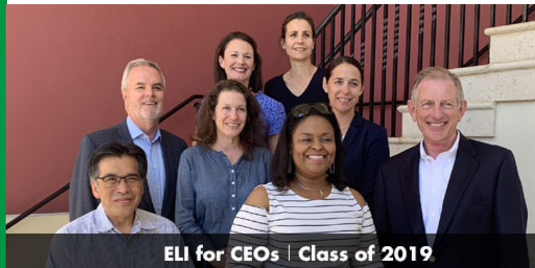
ELI for CEOs | Class of 2019