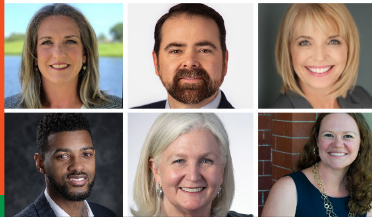
ELI for CEOs | Class of 2020