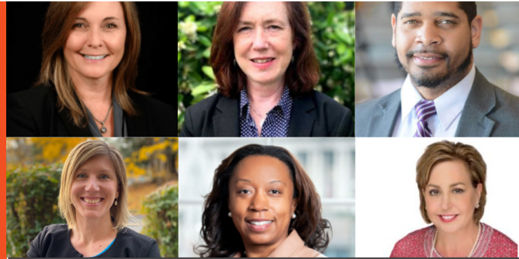
ELI for CEOs | Class of 2021